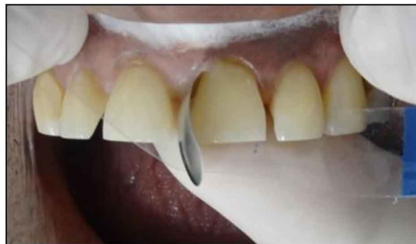
Fig. 5: Palodent® matrix and mylar strip was applied for restoration of 21