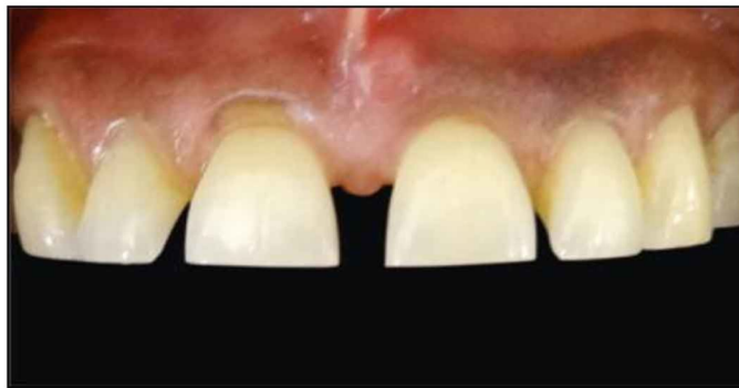
Fig. 2: Preoperative intraoral view of maxillary anteriors