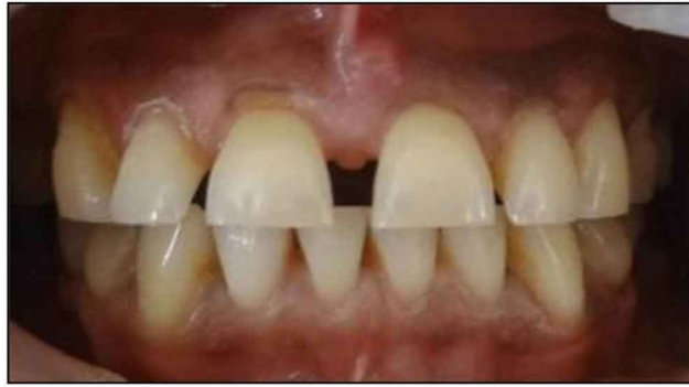
Fig. 1: Preoperative intraoral view of the patient shows interdental spacing in maxillary anteriors