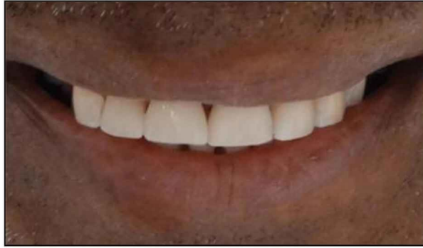
Fig. 9: Postoperative extraoral view of the patient