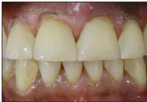
Fig. 10: View of the restorations at 14-month recall