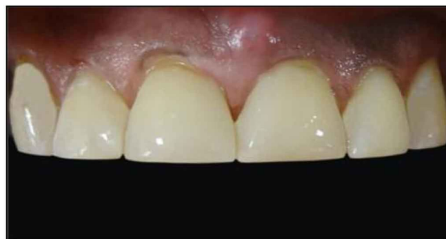
Fig. 8: Labial view of upper anteriors after diastema closure