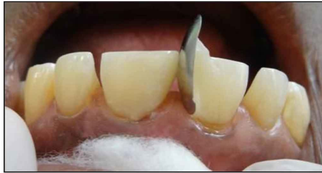
Fig. 6: Restoration of 11- matrix should be inserted slightly into the sulcus for correct emergence profile of the composite