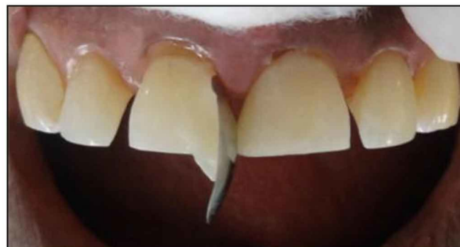
Fig. 7: Anatomic contours can be easily achieved using the contoured matrix