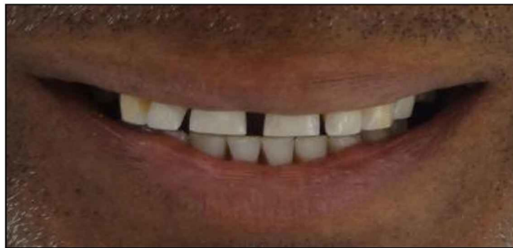
Fig. 3: Preoperative extraoral view of the patient