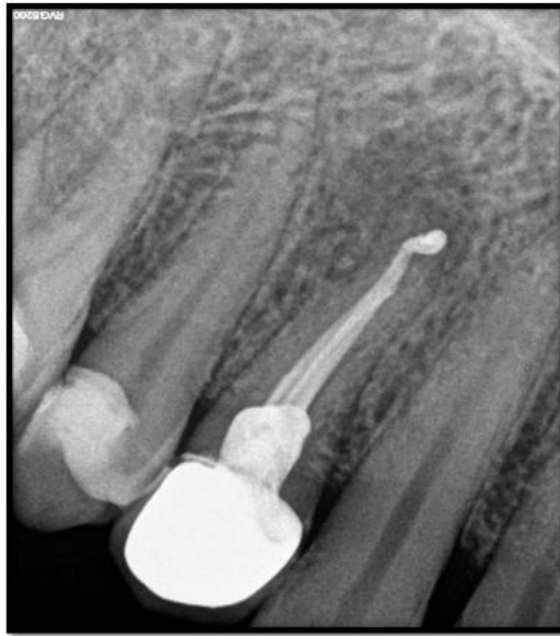
Fig-10: 6 months follow up