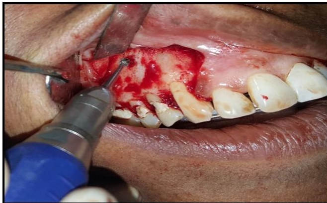
Fig-4: Bone cutting using micromotor handpiece