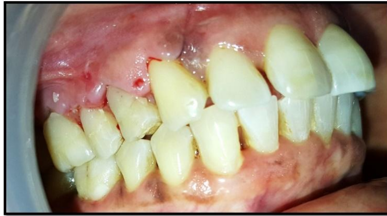
Fig-8: Post-operative view