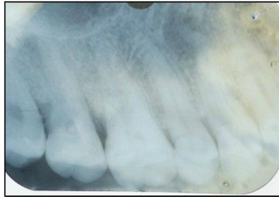
Figure- 1: Pre-operative radiograph