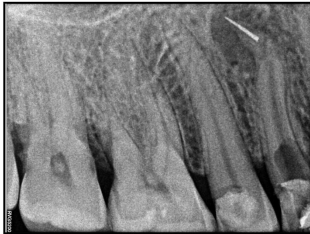
Figure-3: Radiograph showing fractured instrument beyond apex