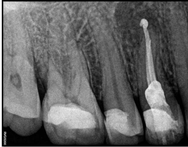
Fig-6: Post-obturation radiograph