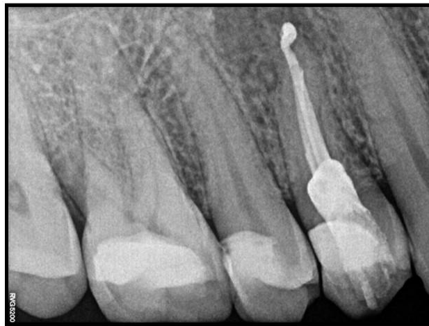
Fig-9: 3 months follow up