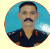
Chairman ACDS Dy GOC, TASA