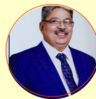
Registrar Army College of Dental Sciences