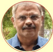
Principal Army College of Dental Sciences