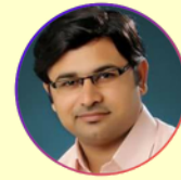
Prof & HOD PMNM Dental College & Hospital, Bagalkot