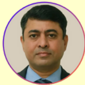
Prof & HOD Dr. HSJ Institute of Dental Sciences, Chandigarh